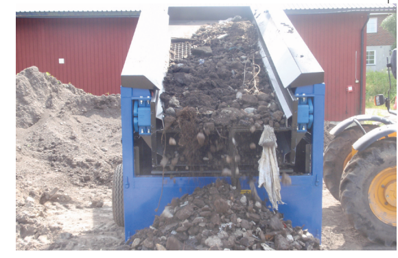
Screening Hardcore and soil with ease

Belt: 1.2m wide 2.7m high stockpile Extras: Spill plates, mesh, road lights