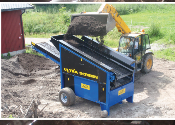
Ultra Deck Screen, the mobile low cost, low noise, high output screening solution