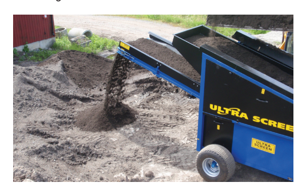
Screening soil at 15mm at rates of 45 tonnes per hour